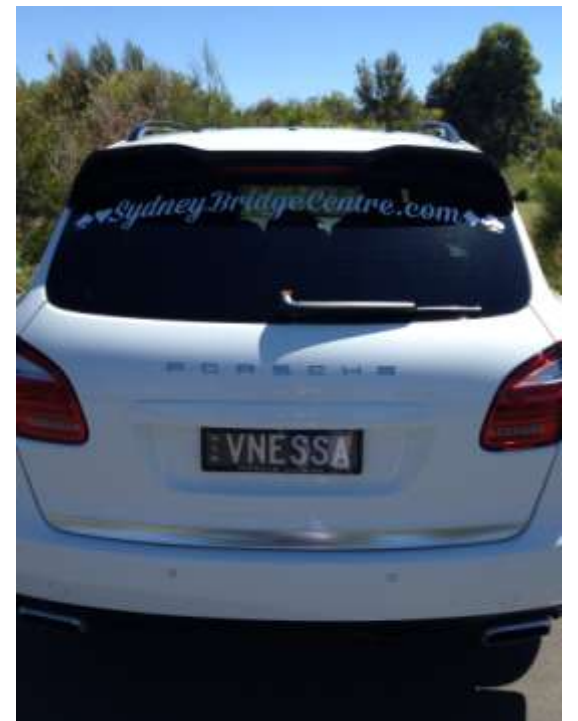
Now when we get stuck in traffic on ANZAC Bridge we are getting people talking about this great game!

Vanessa: 0414 529 031 <u>vanessa@sydneybridgecentre.com</u> Will: 0415 181 901 <u>will@sydneybridgecentre.com</u>